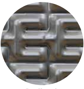
Free Flow plate

If the wastewater has been cleaned and is free of particles, a traditional plate heat exchanger may be the optimal solution. Designed to handle large volumes of wastewater, this type of heat exchanger enables high efficiency and increases energy efficiency in the heat treatment process.