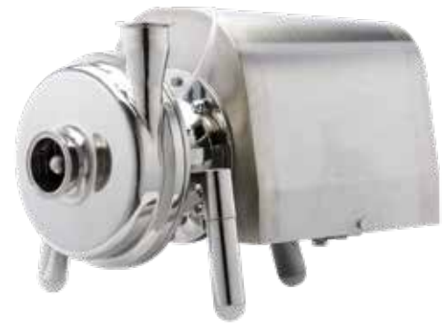
Performance Curves - Complete DanPumps S-FP Range - 50 Hz with max. and min. impeller diameter