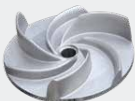
• Vortex impeller made of AISI 316 stainless steel

All impeller are delivered in cast iron, stainless steel and duplex as an option