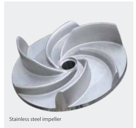
Stainless steel impeller