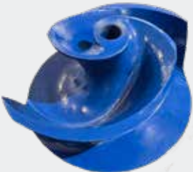
• DP Multi channel impeller