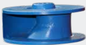
• One or two channel impeller