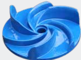
• Vortex impeller