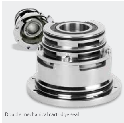
Double mechanical cartridge seal