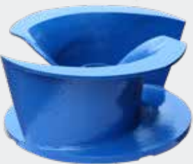
• B-tween impeller